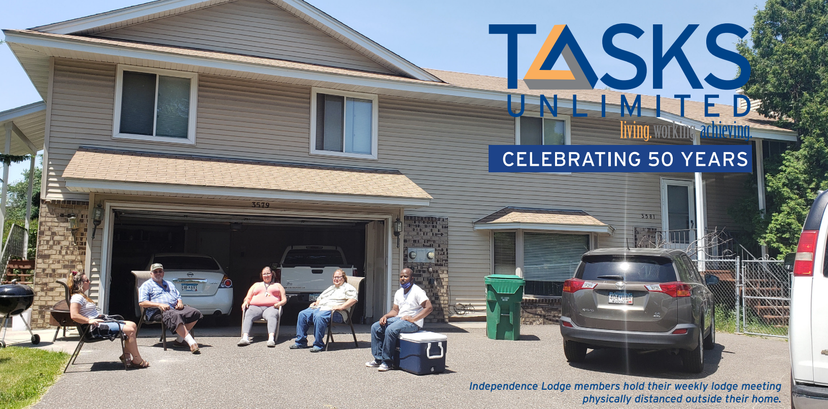
Independence Lodge members hold their weekly lodge meeting physically distanced outside their home.